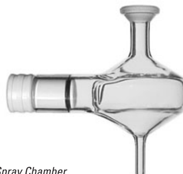
Cyclonic Spray Chamber

Early ICP spectrometers mostly used large volume (>100mL) double pass spray chambers. These generally provided good stability and detection limits. However they had some limitations, including low efficiency and long wash-out times. The availability of the cyclonic spray chamber in the 1990's helped overcome these limitations.