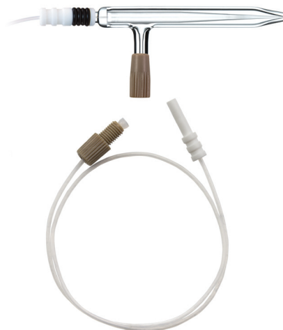
SeaSpray DC Nebulizer for Agilent® 5100/5110/5800/5900 GE P/N A13-07-USS2

With the VitriCone™ design, the sample channel is constructed from heavy glass capillary which is machined to very high tolerances.